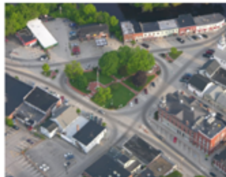
Aerial photo of the Milford Oval

Secondary Trade Area Defined as 10 to 39% of the total commuting population who commute to Milford**